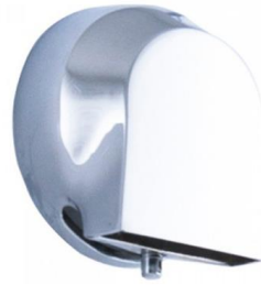
GIO NICCI SPOUT