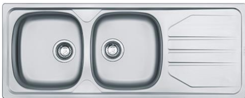
KITCHEN SINK: NOUVEAU NVN 621 STAINLESS STEEL