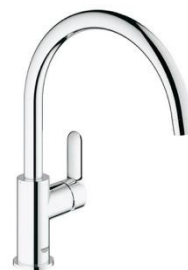
KITCHEN SINK MIXER: GROHE SINGLE LEVER MIXER