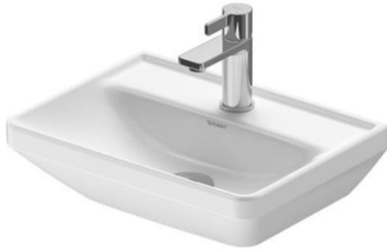
GUEST WC VANITY: DURAVIT 0738500041 D-NEO450x335x130