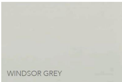
BEDROOM BIC MELAMINE: WINDSOR GREY