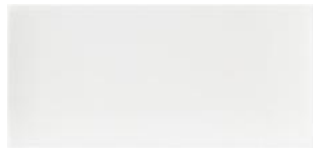
GUEST WC FEATURE WALL TILE: BULEVAR WHITE BRILLO CERAMIC WALL 100 X 305