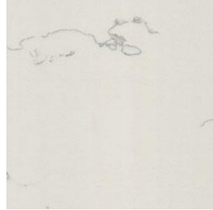
KITCHEN STONE TOP & SPLASHBACK: EEZI QUARTZ WHISPER