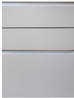
KITCHEN JOINERY STYLE: FLAT DOORS WITH FINGER GRIPS