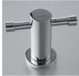
LA GIO BELLA DEMOLA 3300 SERIES DEMOLA DOUBLE ROBE HOOKS