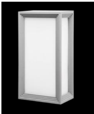
EXTERIOR WALL LIGHT: KLIGHT KLB-5371/SL