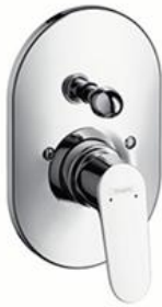
HANSGROHE DÉCOR E2 MIXER DIVERTER