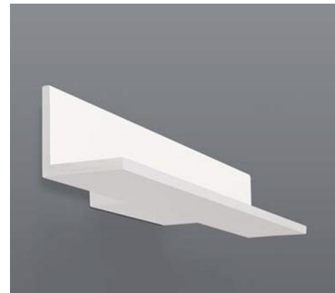
WALL LIGHT: SPAZIO STRIDE