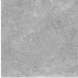
BATHROOM FLOOR TILE: PSC 20 R 00 EA, 600 X 600