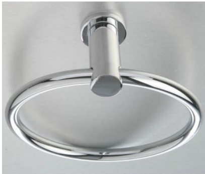
LA GIO BELLA DEMOLA 3300 SERIES DEMOLA TOWEL RING