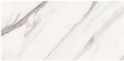
MAIN EN-SUIT WALL TILE: BX ET RAILTO CARRARA MATT 300 X 600