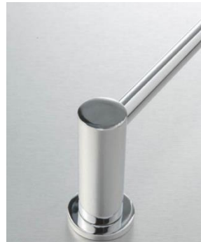
LA GIO BELLA DEMOLA 3300 SERIES DEMOLA SINGLE TOWEL RAIL 760MM