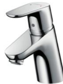
HANSGROHE DÉCOR E2 BASIN MIXER