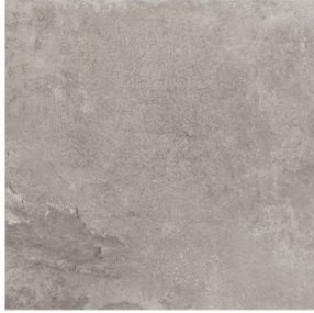
OUTDOOR TILE: PIETA – BIANCO GRES