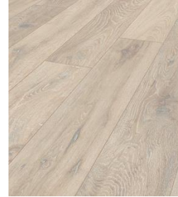
MAIN FLOOR FINISH: VINYL COMO MOUNTAIN WEISSHORN