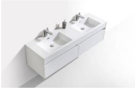
BATHROOM VANITY: GIO PH 1200MM DOUBLE BASIN AND CUPBOARD