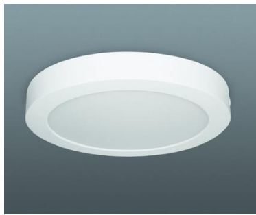
CENTRAL LIGHT: SPAZIO SATURN SURFACE 18W – 3000K