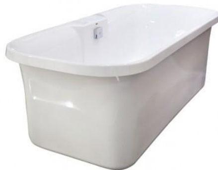
OTTAWA SKIRTED FREE STANDING BATH