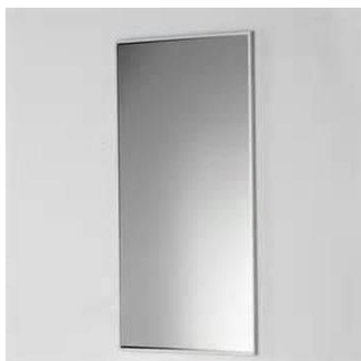
GIO MIRROR 900X400X20MM ALUMINIUM FRAMED