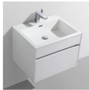
BATHROOM VANITY: GIO PH 600MM BASIN AND CUPBOARD