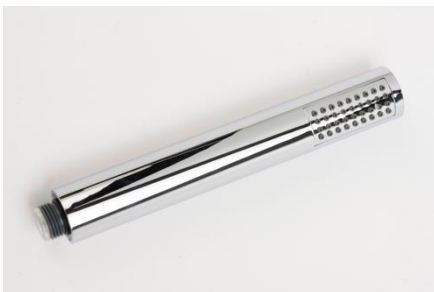
GIO TUBULAR HAND SHOWER