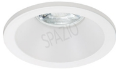
DOWNLIGHT: SPAZIO 2303