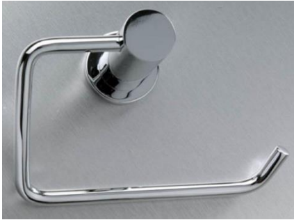
LA GIO BELLA DEMOLA 3300 SERIES DEMOLA PAPER HOLDER