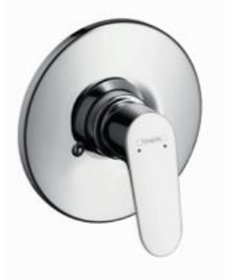
HANSGROHE DÉCOR E2 SHOWER FINISH SET